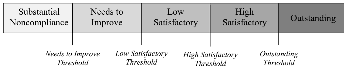
Figure 1: Illustration of thresholds and performance ranges